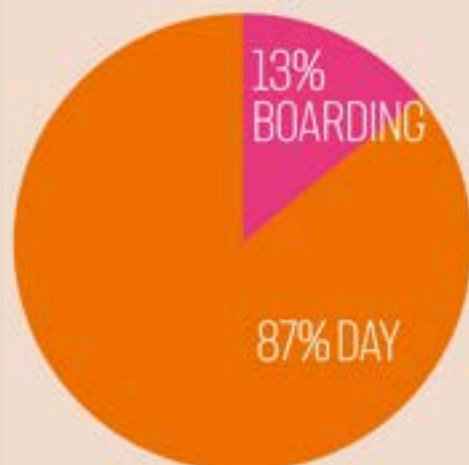
Ratio of Senior Day and Boarding Students