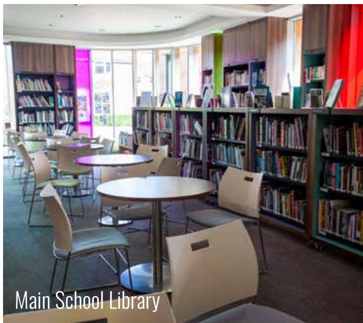
Main School Library