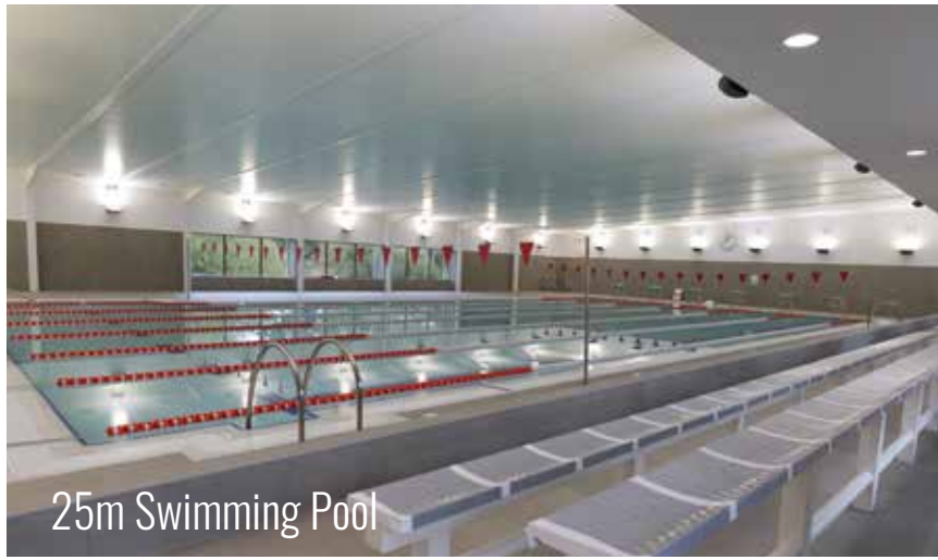
25m Swimming Pool