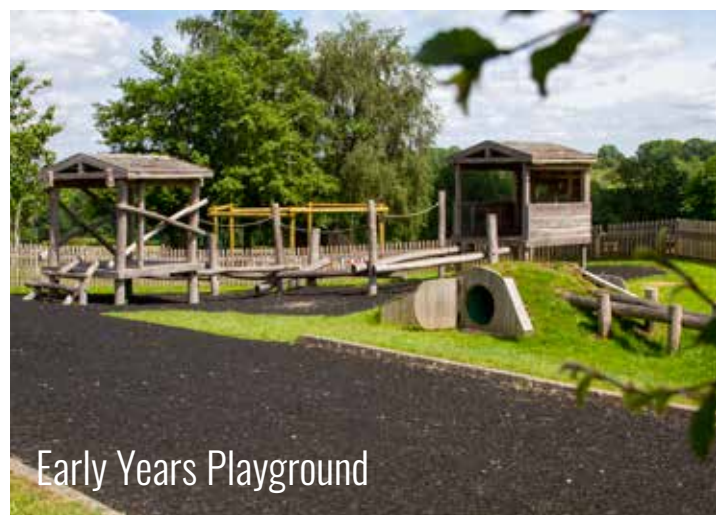
Early Years Playground